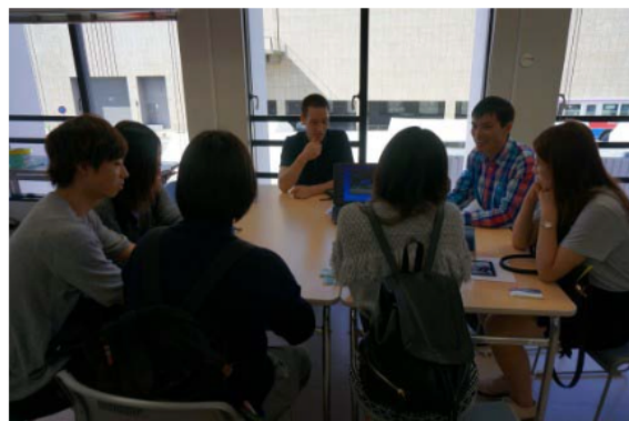
“JET Café,” our English chatting area

On Sunday October 28th, there will be a JET Programme Booth at the Nagasaki International Festival, to be held at the Dejima Koryu Kaikan in Nagasaki City. We need your help to make it an amazing event!